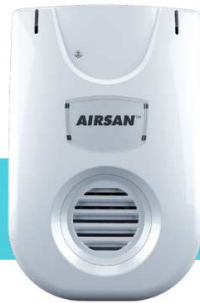
Airsan™ Odor Neutralizer